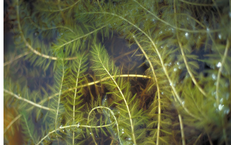
Eurasian Water Milfoil

2024 was a good year for water quality in our lake! In 2023 we had to perform two herbicide treatments for Starry Stonewort and Eurasian Water Milfoil. As you may recall, this year our Spring scan found very low levels of these two invasive species. However, as we expected, our scan in late July found higher levels due to Summer growth. We found 1 acre of Starry Stonewort near the boat launch, and a little over 5 acres of Eurasian Milfoil across the rest of the lake. These populations were successfully treated at a cost of $7,835. Remember that it is virtually impossible to completely eradicate these invasive species once they are established. As a result, it is critical for us to be vigilant with regular lake scans and treatments