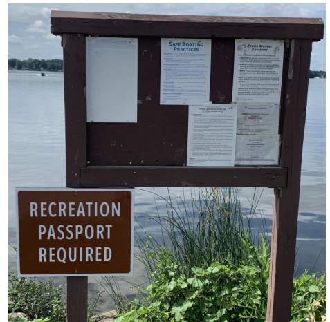
Did you know that State Recreation Passports are required to launch at Crystal?

lands...' Lake Fenton, Orchard Lake, Union Lake, and Little Whitefish Lake (a much smaller lake than Crystal but also in Montcalm) are specifically mentioned. The CLA awaits the DNR's response.