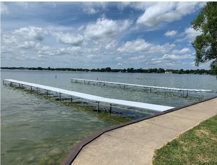
Though permanent bumpers are installed on the dock, boaters are encouraged to utilize their own bumper-fenders and ropes when tying-up to the dock.

In June of this year, the DDA proposed a three-way partnership to purchase dock sections for the community. The CLA Board, believing from the July 2017 discussions that the membership was in favor of installing a public dock at the park, and having the fund balance to contribute toward this long standing goal, voted unanimously in support of donating one third of the total $30,000 cost.